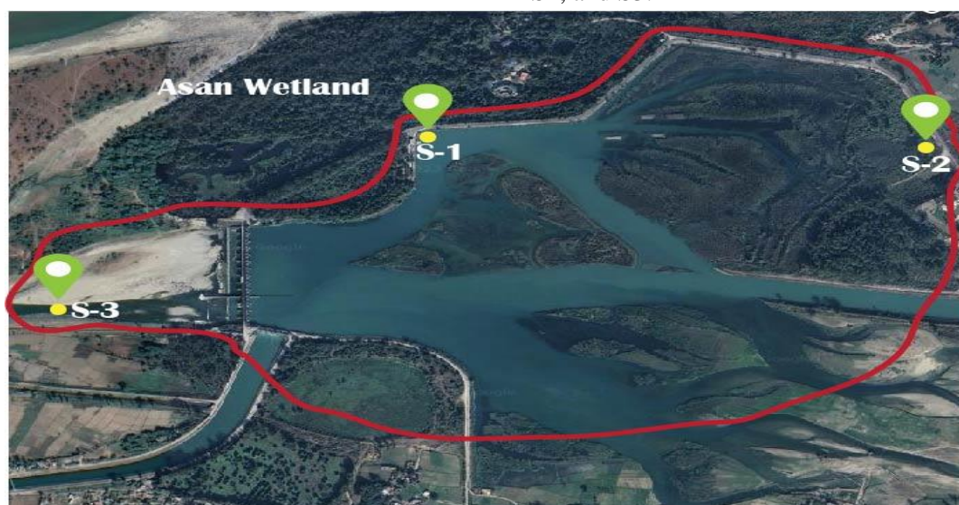
Fig. 1: Showing the sampling sites

Study Area: The Asan Wetland, also known as Dhalipur Lake, is located at the confluence of the Asan River and the Eastern Yamuna Canal in Dehradun, Uttarakhand, India (30.26° N, 77.40° E). It spans an area of 444.4 hectares at an elevation of 400 meters above sea level. Created in 1967 with the construction of the Asan Barrage, this man-made wetland is recognized as Uttarakhand's first Ramsar Site (2020) and a Conservation Reserve (2005). As a critical habitat, the wetland supports diverse ecosystems, including open water, marshes, mudflats, and grasslands, which sustain a variety of flora and fauna. It is an Important Bird Area (IBA), hosting over 125 bird species, including residents and winter migrants (Tabassum et al 2024). Seasonal fluctuations in water levels and its subtropical climate foster a rich diversity of aquatic macrophytes. Despite its ecological significance, the wetland faces habitat degradation, pollution, and the spread of invasive species like Eichhornia crassipes (water hyacinth). Conservation initiatives are crucial to maintaining the wetland's biodiversity and ecological balance. Fig:1 shows the selected sampling sites named S1, S2, and S3.