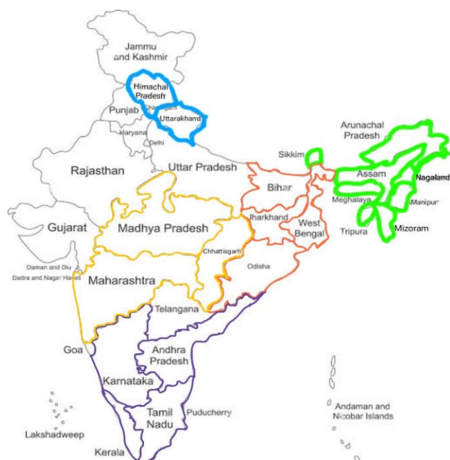
Fig 2. Map in the study area