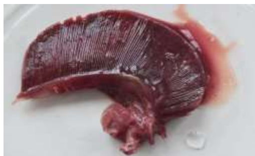
Fig.1: Infected fish and Fresh gill of Schizothorax richardsonii infected with myxozoan parasite.