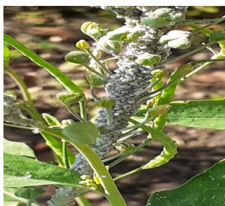
Mustard aphid ( Lipaphis erysimi )