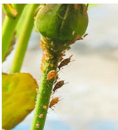
Rose aphid ( Macrosiphum rosae )

Morphological and behavioural changes were observed in aphids after photosensitizers and UV-B exposure (Fig.3-5).