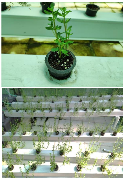
Fig 3. B. monnieri under hydroponic conditions inside greenhouse

Coarse ground powder taken in round bottom flask fitted with condenser and refluxed for 1 hr using water (6 volume w.r.t. batch size) as solvent at 80°C.