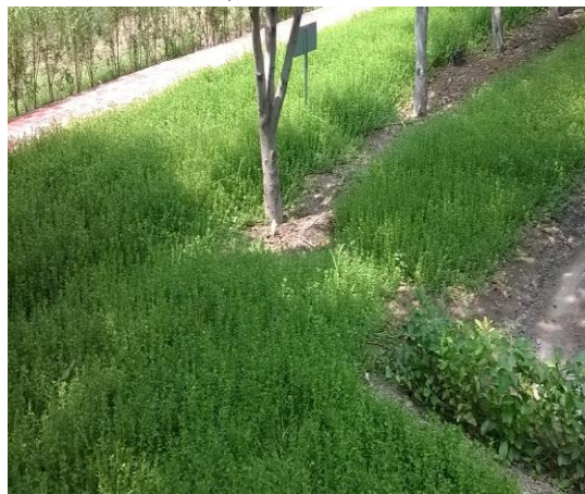
Fig 1: B. monnieri in natural habitat (Chywan vatika)

voucher/field collection number (accession number-1129762).