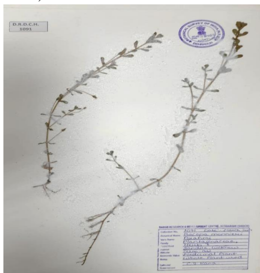
Fig 2. In-house herbarium specimen (accession number-) of B. monnieri

The plant species were identified by consulting the Herbarium of Botanical Survey of India, (BSD) Dehradun, Forest Research Institute (DD) Dehradun and Garhwal University Herbarium (GUH) Srinagar Garhwal, Uttarakhand. Raw material (RM) of the same has also been identified through powder microscopy and anatomical section as per standard methods. The whole plant parts of the plants (as a raw material) along with herbarium specimens (accession number-1129762) have kept in the museum as