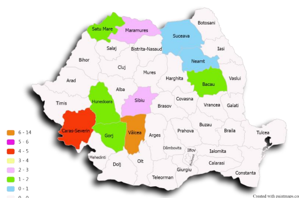
Fig 1: Territorial profile of mountain producers of Cherries, Sour cherries

The Romanian cherry and sour cherry market appreciated and depreciated in the last five years (2017-2021), with cherry exports ranging from $486,000 to $951,000 (+95.67%) and cherries from $292,000 to $25,000 (-91.43%) (ITC 2022). The mountain producers of cherries and sour cherries are mainly located in Valcea, followed by Caras-Severin, then Maramures and Sibiu (Fig 1) (ANZM, 2022 & 2023).