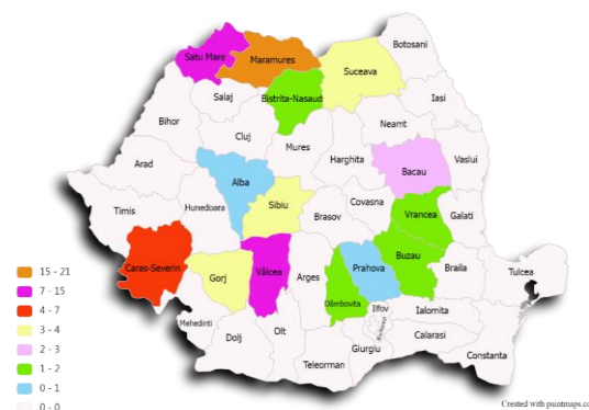
Figure 5. Territorial profile of mountain plum producers

The Romanian plum export market varied during the period 2017-2021 by +3.21% (from $560,000 to $578,000) (ITC, 2022). Mountain producers from Maramures, Valcea, Satu Mare, and Caras-Severin are among the top plum entrepreneurs in Romania ( Fig 5 ) (ANZM, 2022; ANZM, 2023).