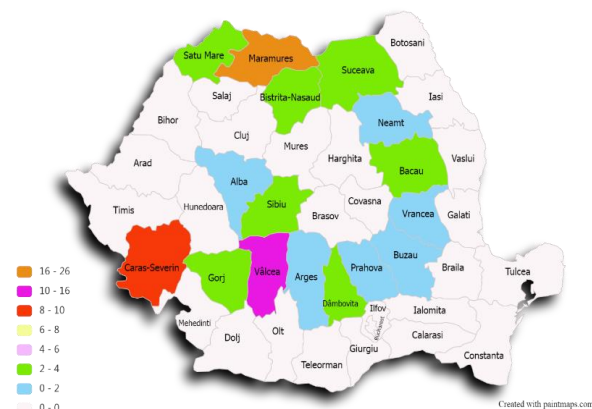
Fig 2: Territorial profile of mountain apple producers

The Romanian apple market decreased considerably annually during the period 2017-2021, by -46%, reaching $182,000 in 2021 (ITC, 2022). The Romanian mountain counties with the most important apple production are Maramures, Valcea, and Caras-Severin ( Fig 2 ) (ANZM, 2022; ANZM, 2023).