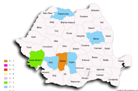
Fig 4: Territorial profile mountain producers of Peaches, Apricots, Nectarines

Caras-Severin ( Fig 4 ) (ANZM, 2022; ANZM, 2023).